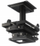
PSS-650 Projector Ceiling Bracket for Installation