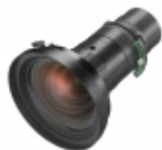
VPLL-Z3009 Short focus zoom lens