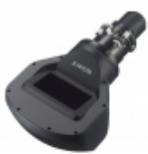
VPLL-3003 Projection Lens for the VPL-F Series