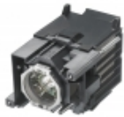
LMP-F280 Replacement Lamp for the VPL-F Series