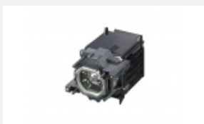
LMP-F272 Replacement Lamp for the VPL-F Series