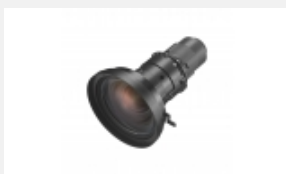
VPLL-2007 Projection Lens for the VPL-F Series