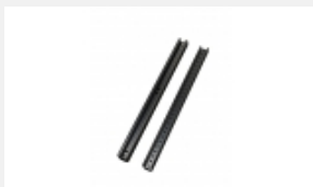
PSS-650P Projector Ceiling Bracket for Installation