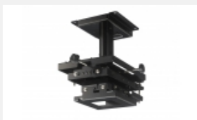
PSS-650 Projector Ceiling Bracket for Installation