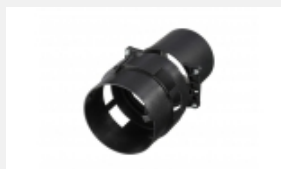
PK-F30LA1 Lens adaptor