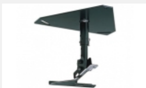
PSS-610 Projector Ceiling Bracket for the VPL-F Series