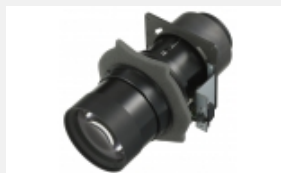
VPLL-Z1032 Projection Lens for the VPL-F Series